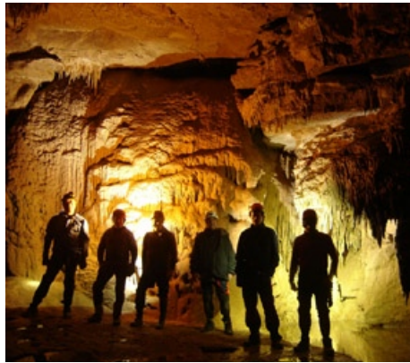
Illiad borehole. (Dave McRae)

There's a very nice formation gallery on one side. We explore for a while but it seems like there is no time. You could spend hours looking around. When we climb back down we notice huge trunk passage going both ways. Ceilings weren't discernible with Sten lights. Some of the largest passage I've seen in Alabama.