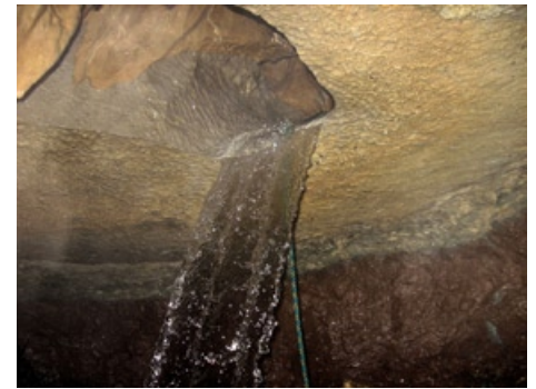
Nozzle exit.

At your feet is a little flowstone hole with water pouring in. You squeeze in head first and crouch into a little room with water rushing all around you. You then spin around and slide down an even tighter spot on your back. You squeeze and slide for a few feet and then drop off into a little 5' pit in the waterfall. The whole experience with the water rushing around you and having to put your head halfway in the water is very freaky. Plugging the water with your body in such a small area also makes you uneasy.