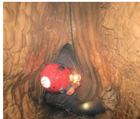
Nozzle entrance.

From the bottom you can go a couple of ways. Climb up 8' and look for a squeeze on the left. This will pop down into a room but instead climb back up into a crawl on the other side. After some more hands/knees you come to the third pit of 15'. It's in a breakdown room and the rig is a large block at the edge of the pit. From the bottom you intersect the passage from the Odyssey entrance. Climb over and down breakdown and look for a deep channel where both cave streams meet. Chimney down 20' and do a sideways squeeze for a bit in clean washed passage. Eventually you get to the beginning of the "Nozzle."