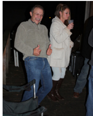
Who has two thumbs and loves a good party? THIS GUY!!!!