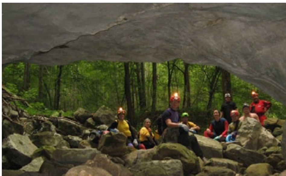
Entrance to Gross Skeleton.