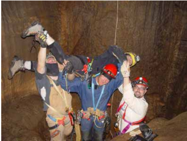
Fun at the bottom of the pit.

and made it to Dairy Queen 10 minutes before closing much to the chagrin of the employees. Great day!