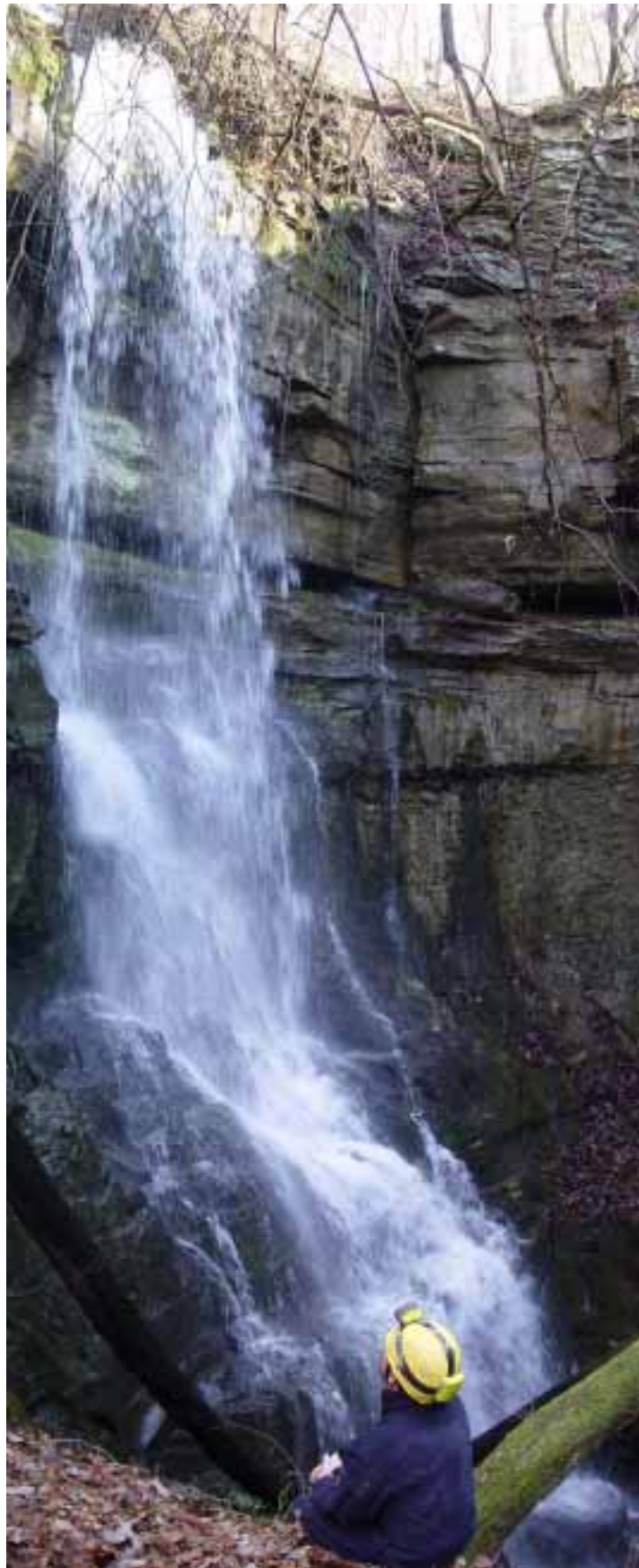
A Self Portrait by John Roberts

After parking at the designated parking lot we all geared up and headed out on the 1.5 mile trail. We passed a few enticing holes on the way but kept our goal in focus. The trail starts out well trodden but towards the top seemed to pitter out as it gets steeper up the mountain. We got off trail for a little ways but eventually heard the Lost Cave waterfall crashing in the distance and quickly found it again. It had been raining all week so quite a lot of water was falling into the sink. The entrance was about 60 feet across and about 60 feet deep with one side as a walk-down. At the back of the sink is a 30 foot drop but with the amount of waterflow, we all opted out. According to the map the cave is only 100 feet long but I am curious as to where all that water goes. John started setting up for some pictures while Ryan and I headed to rig Esslinger Pit. We both bounced the 110 foot pit. It was a little tight in the middle but opened up toward the bottom. Ryan found the rope short so he had to come back up after being six feet from the bottom. We fixed the short rope and I headed down. Once back up, we all decided to quickly head to Sandy Lynn and rig it before dark. It was only a five minute hike and we just managed to rig two ropes down the 88 foot